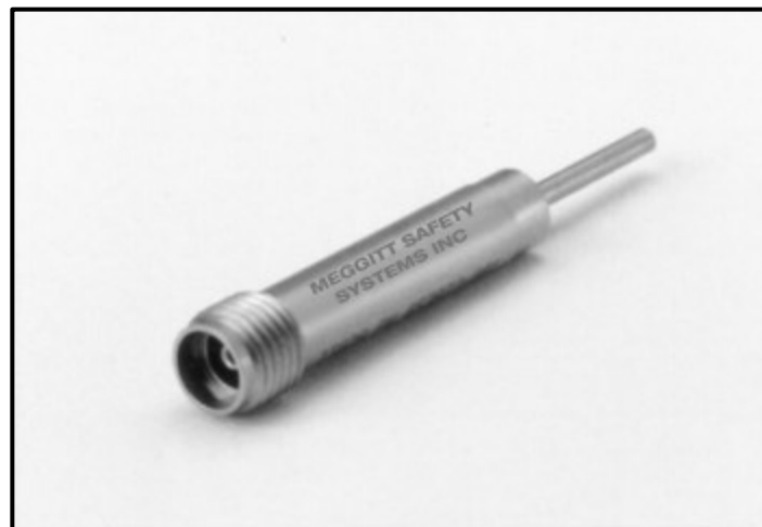
MSSI part #853872

The SMA UHV feed-through features a pure 50-ohm impedance with a long center pin extension suitable for attachment to the strip line section of a beam position monitor (BPM). Meggitt Safety Systems Inc. (MSSI) designed the outer-body material for welding directly into a chamber using laser, e-beam, or TIG methods.