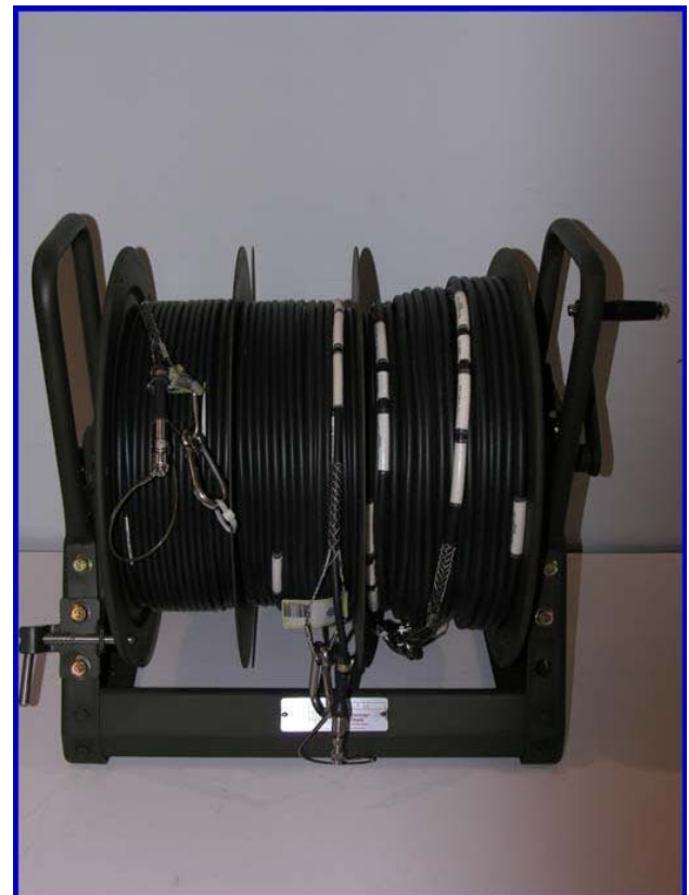
FE26RX, FE34RX and FE54RX assemblies on a custom reel