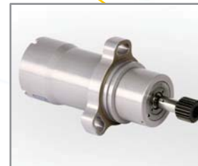
Fuel Flow Regulation Fuel Metering Valve Control