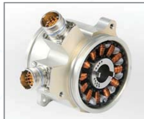
FADEC and FBW Permanent Magnet Alternators