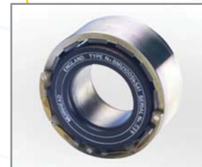
Pod Gimbal Motor and Sensor