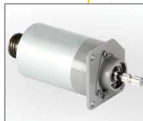
Collective Pitch Control Positioning