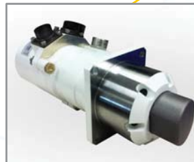
Linear Lock Actuator