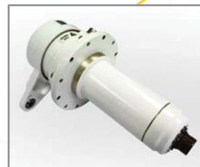
Landing Gear Actuator