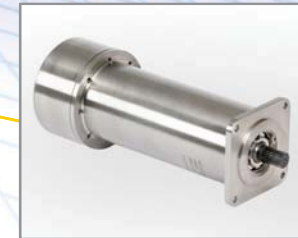
In-flight Refueling Probe Extender Actuator