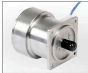
Throttle Lever Position Transmission Throttle Box Motors