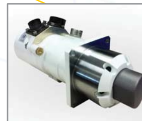
Linear Lock Actuator