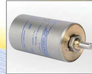
Cockpit Illumination Control