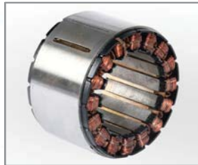
Flight Control Motors