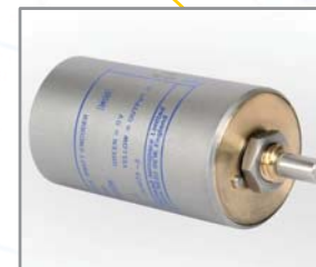
Cockpit Illumination Control