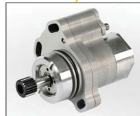
Engine Control Position Sensors