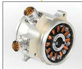
FADEC and FBW Permanent Magnet Alternators