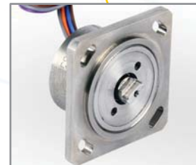
Bomb Bay Door Position Sensing