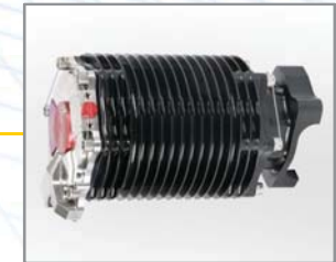
Spoiler EBHA Motor